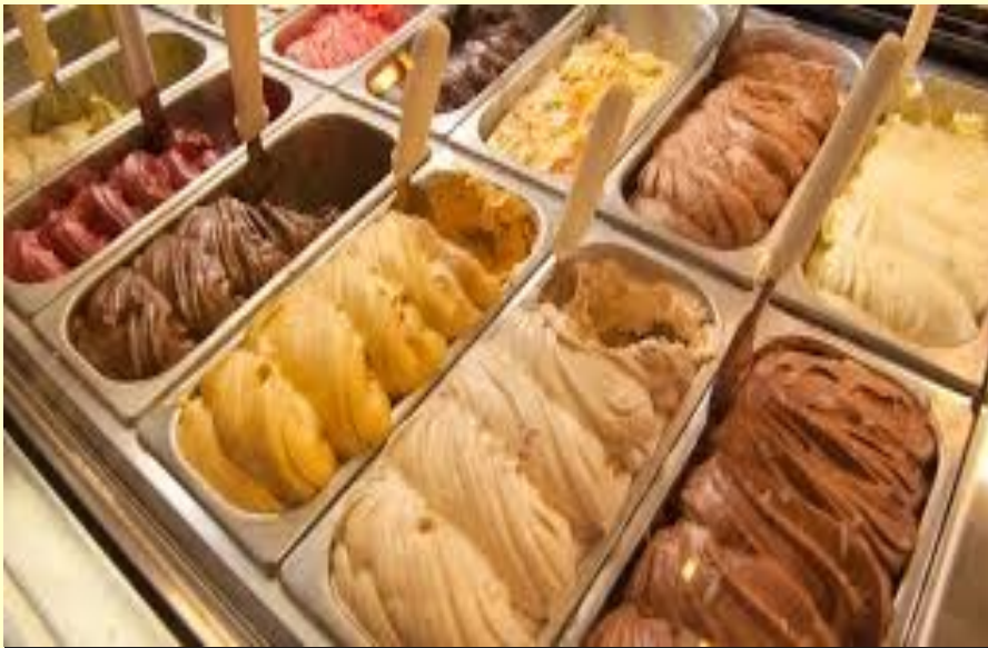
Every year, the Honor Society organizes Il festival del gelato.