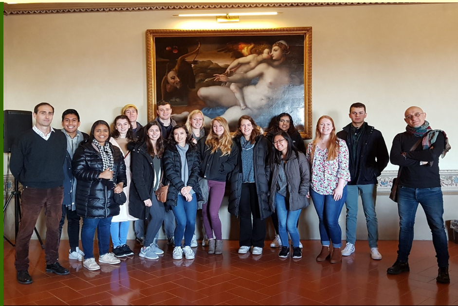
UVA students visited La Scuola Normale Superiore in Pisa during their stay in Tuscany.